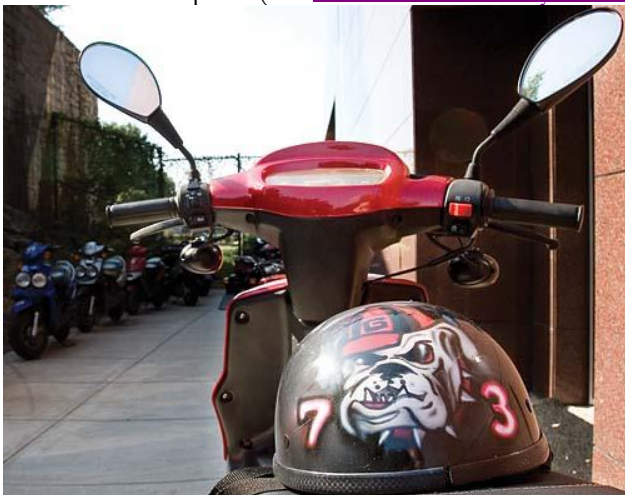
←A good sign of who to avoid on the roadways.

In Athens “moped mania” has taken hold as U[sic]GA students abandon their father/uncle's tractors for mopeds (see Scooter Trend May Be Bad News for Bulldogs ).