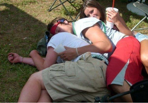
←Matthew Stafford (center) is excited about playing in midtown.

cousins. Don't be a homewrecker: if a Georgie girl or boy is hot, and is at the game with their cousin, they are already taken.