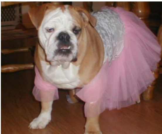
←She's of age in dog years. And she's Mark Richt's prom date.